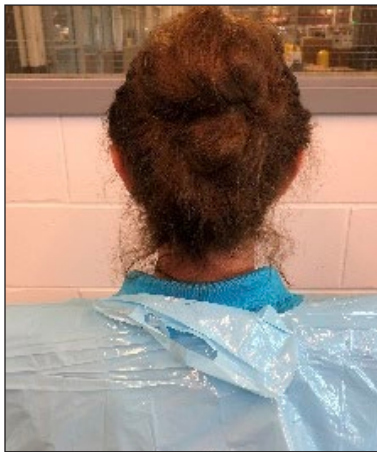
4. Place head through neck opening.