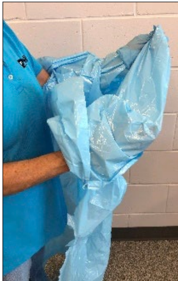
3. Remove arms from sleeves and hands from gloves.