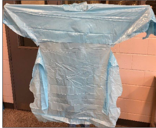
2. Ensure gown is at full length.