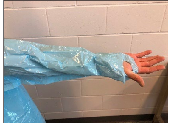
3. Place arms through sleeves ensuring thumbs are inserted through thumb loops.