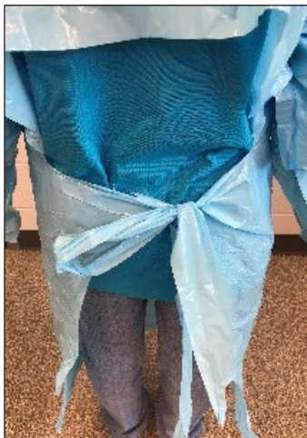
6. Gown is ready to be tied in back or ties can be pulled around in front of gown and tied.