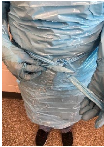
2. Release gown ties around waist by untying or pulling gown forward to force separation of tie from around waist.