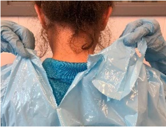
1. Separate gown at shoulders by tearing along back perforation.