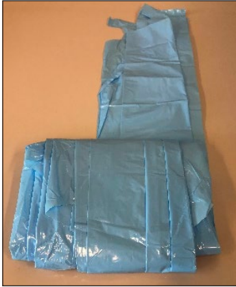
1. Unfold gown.