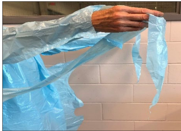
5. Untack gown ties ensuring that they are at full length.