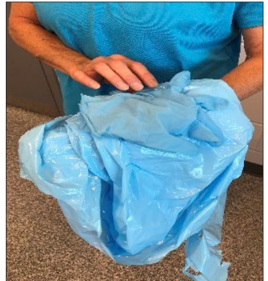
4. Gown and gloves are ready to be disposed of in an environmentally safe and appropriate manner.